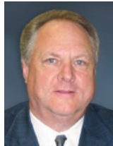
Dale M. Christensen Charlotte DI Center